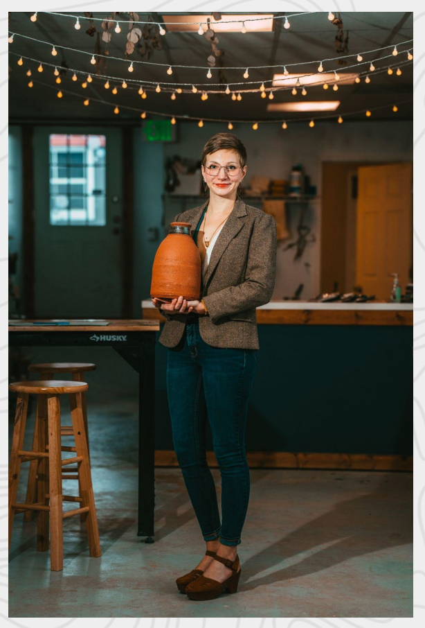
Canton - Haywood County