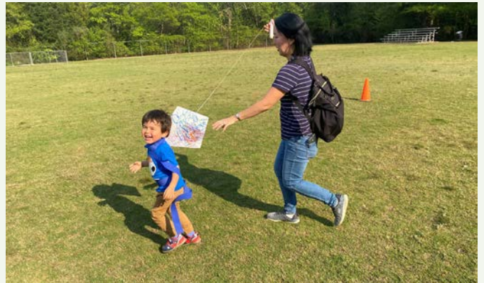
Whether you want to take a stroll on the one-mile border trail through the wetlands to Bones Creek, play a game of tennis, fly a kite or have a family picnic, Lake Rim Park offers something for everyone.