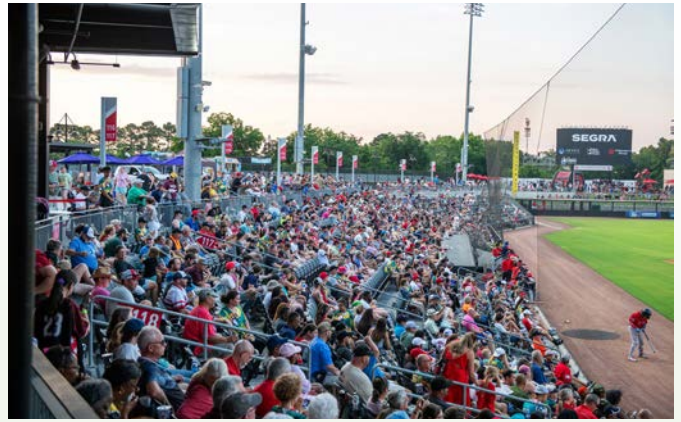
Segra Stadium, home of the Fayetteville Woodpeckers, is one of several entertainment venues located in Fayetteville.

Learn more about the opportunities in Fayetteville here and get a taste of what a weekend is like in Fayetteville by watching this short video .