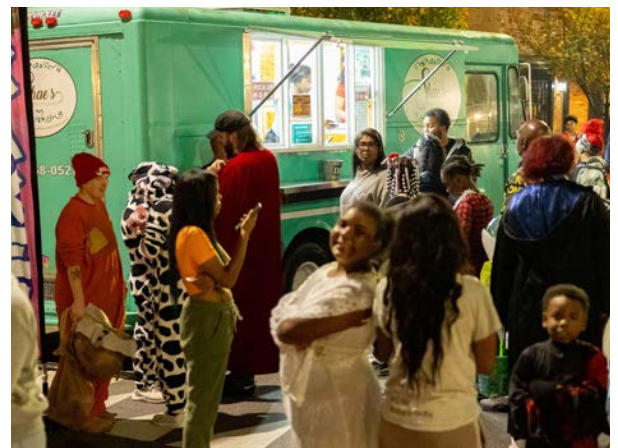
Among the many activities supported by the CSDD are Zombie Walk , a free family-friendly event with food trucks, vendors, artists and more (above left), and 4th Friday , which features visual and performing arts, live music, street performers, and local businesses and is held on the fourth Friday of each month from March to October (above right).