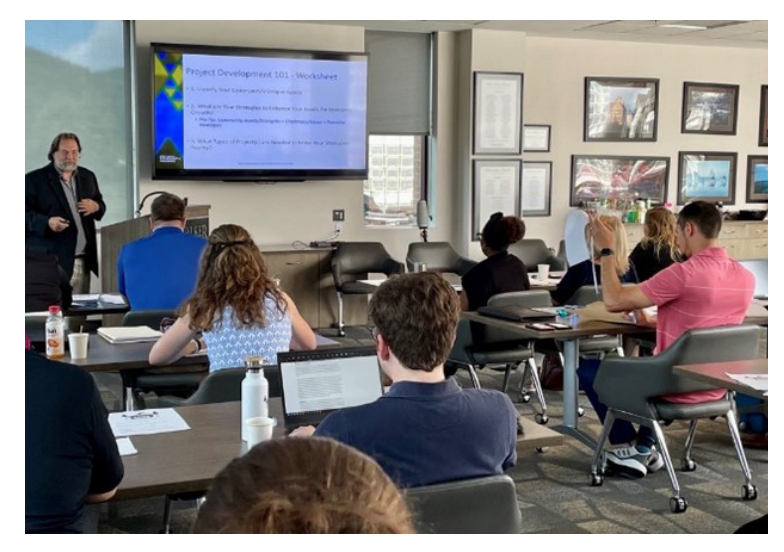
Rural Planning program project development training with 2023 RC2 communities.

2023 Annual Report NC Rural Planning Program