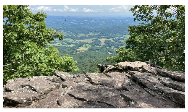
View from Mount Jefferson in Mount Jefferson State Natural Area, Ashe County, NC.

The Rural Planning program facilitates planning processes with CORE communities to identify outdoor recreation assets that present economic growth opportunities and to create strategies to develop them. Strategies focus on actions and projects communities can undertake to increase tourism, encourage small business development, enhance quality of life for residents, plan for asset and infrastructure development, and/or position themselves to grow and attract outdoor gear manufacturers. The CORE program will also provide technical assistance and training to help participating communities implement their strategies. At the end of 2023, 7 local governments had adopted CORE strategic plans and 13 had plans in progress.